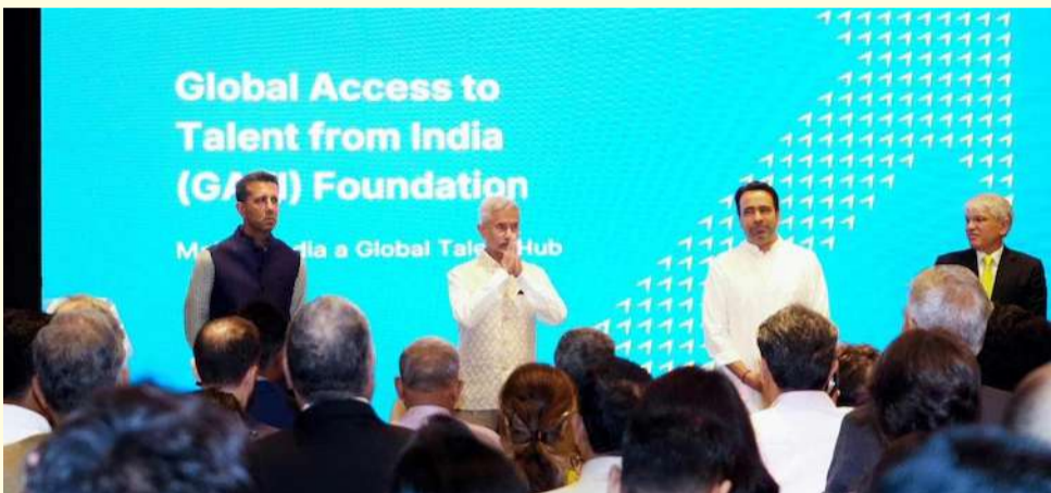
Union Minister for External Affairs Dr Jaishankar speaking at the GATI Foundation function in New Delhi.