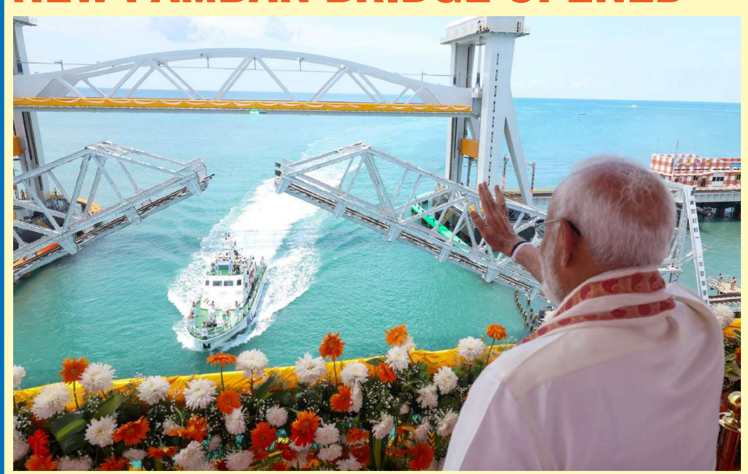
Prime Minister Narendra Modi inaugurated the Pamban Bridge over the sea at Rameswaram in Tamil Nadu.

STR's findings also re-(Cont. on page-7)