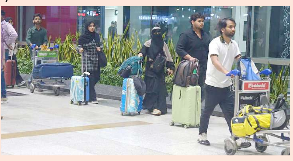
Stranded Indian students in Iran arrived back Delhi airport on Thursday.

Iran and evacuated, boarded the flight to of students to Iran. have landed at Delhi's Delhi late last evening. Indira Gandhi Interna- Iran is currently engaged more than 13,000 Inditional Airport. A major- in hostilities with Israel ity of them, 90 are from and the families of Indi- of whom are pursuing an students have been a medical degree. In a The students all from desperately seeking help statement, the J&K Stu-Urmia Medical Universi- from the government. dents' Association has ty and the first students' There have been mas-