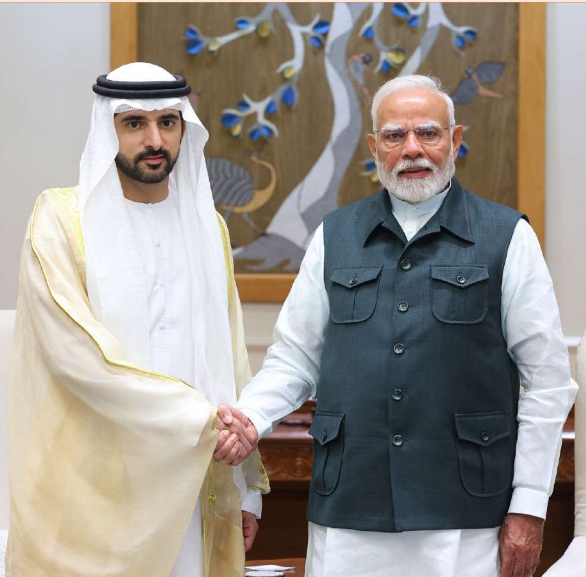
Prime Minister Narendra Modi with the Crown Prince of Dubai, Deputy Prime Minister and Minister of Defence His Highness Sheikh Hamdan Bin Mohammed Bin Rashid Al Maktoum in New Delhi. tween India and the UAE, emphasising the enduring partnership built on mutual trust and a shared vision for the future". Modi expressed his gratitude to the leadership of the UAE for ensuring the welfare of around 4.3 million Indians living in the UAE.

edged the valuable contributions of the Indian community to the development of the UAE and highlighted the UAE's efforts to provide an inclusive environment for all residents. Sheikh Hamdan had high-level discussions with Modi. He also met Defence Minister Rajnath Singh and discussed trade ties and stepping up defence manufacturing collaboration. The Crown Prince, who is also the UAE's Deputy Prime Minister and Minister of Defence, met External Affairs Minister S Jaishankar . Modi posted on X after the meeting: "Dubai has played a key role in advancing the India-UAE Comprehensive Strategic Partnership. This special visit reaffirms our deep-rooted friendship and paves the way for even stronger collaboration in the future." Recalling his visit to the UAE last year during which he participated in the World Government Summit in Dubai as Guest of Honour, Modi said Sheikh Hamdan's visit "signified generational continuity in the strong and historic ties be-