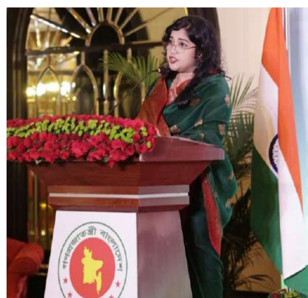
Deputy High Commissioner of Bangladesh in Mumbai HE Farhana Ahmed Chowdhury welcoming the guests at the 56th Independence and National Day of Bangladesh in Mumbai.