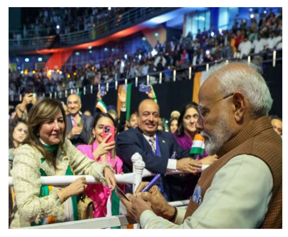
Prime Minister Narendra Modi attends an Indian community programme in Kuwait City.