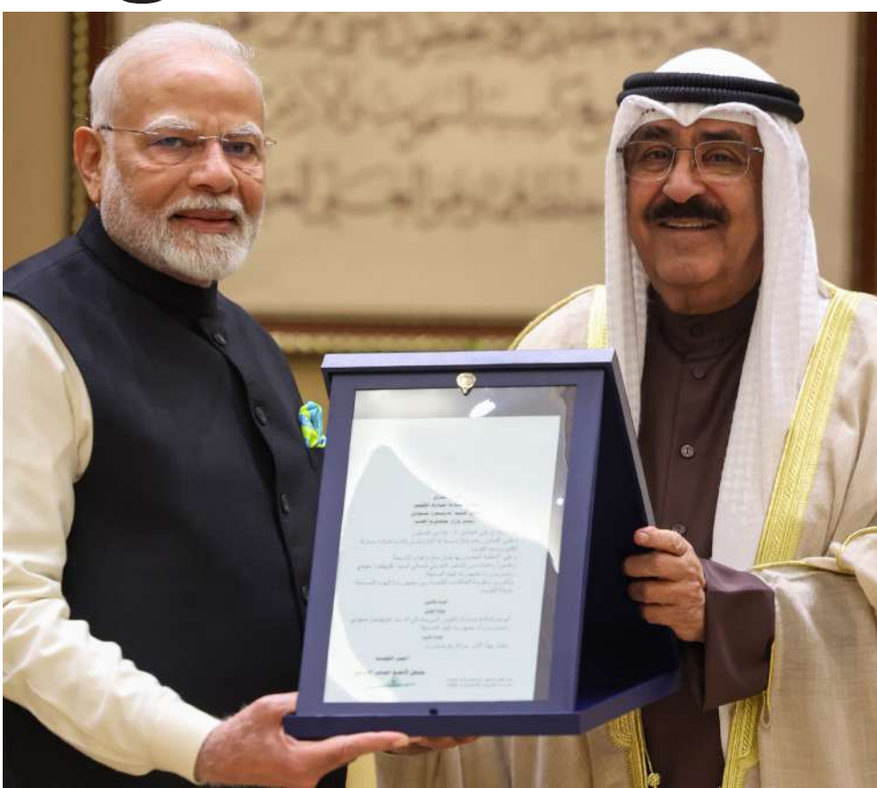
Prime Minister Narendra Modi receives Kuwait's highest honour "The Order of Mubarak Al Kabeer" from Amir of Kuwait His Highness Sheikh Meshal Al-Ahmad Al-Jaber Al Sabah in Kuwait.

KUWAIT CITY: Kuwait on Mubarak Al Kabeer" to Sunday bestowed its high- Prime Minister Narendra est honour "The Order of Modi, in appreciation of