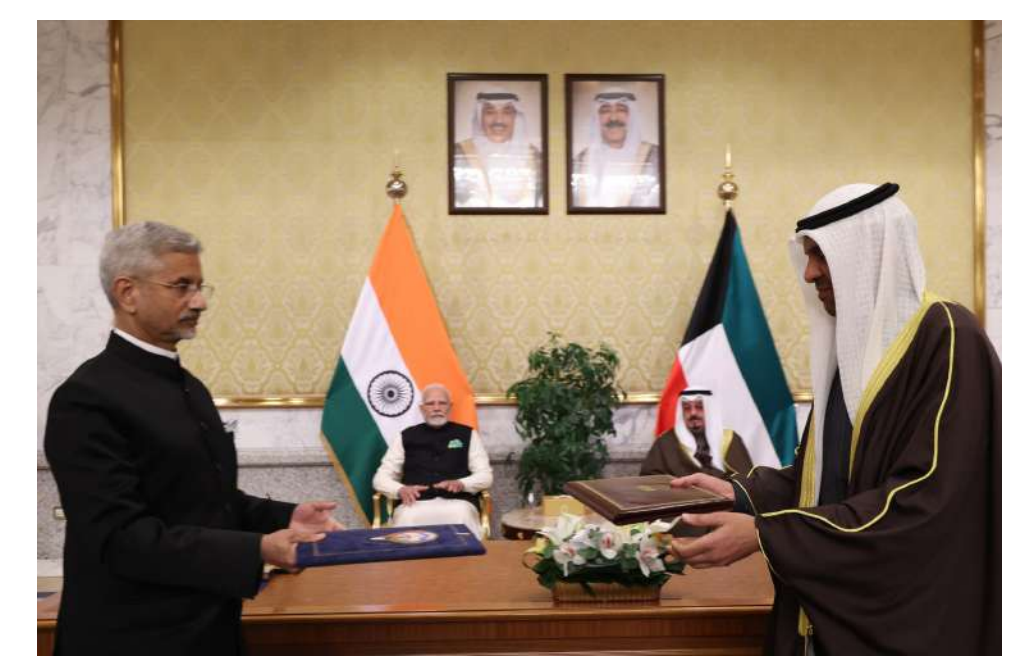
External Affairs Minister S Jaishankar and Kuwait's Foreign Minister Abdullah Ali Al Yahya exchanging Memorandum of Understanding (MoU) to establish a Joint Commission for Co-operation (JCC) at the level of foreign ministers.