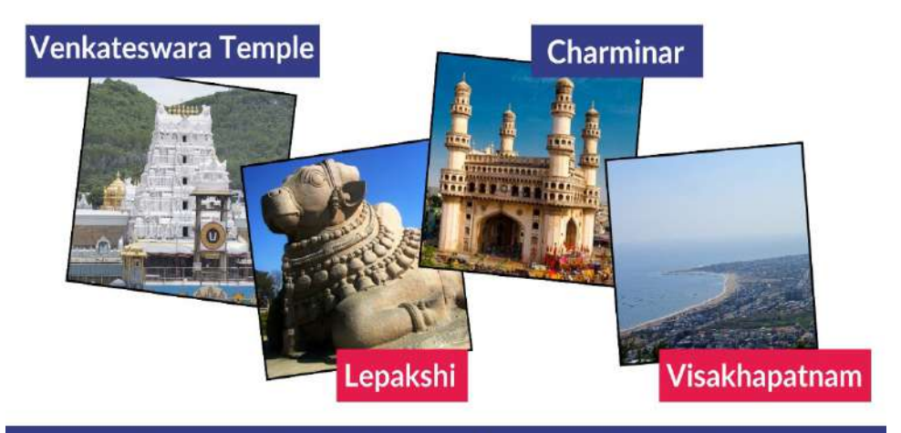
www.flycreative.in | www.flycreativeglobal.com

BOOK YOUR ADVERTISEMENT IN ONE E-NEWSPAPER. We use all social media platforms to connect with target audiences instantly.