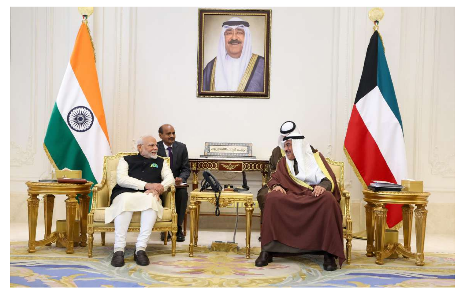
Prime Minister Narendra Modi met with His Highness Sheikh Sabah Khaled Al-Hamad Al-Sabah, the Crown Prince of Kuwait.

KUWAIT CITY: Prime Minister Narendra Modi met with His Highness Sheikh Sabah Al-Khaled Al-Hamad Al-Mubarak Al-Sabah, Crown Prince of Kuwait. Modi fondly recalled his recent meeting with His Highness the Crown Prince on the margins of the UNGA session in Sept 2024.