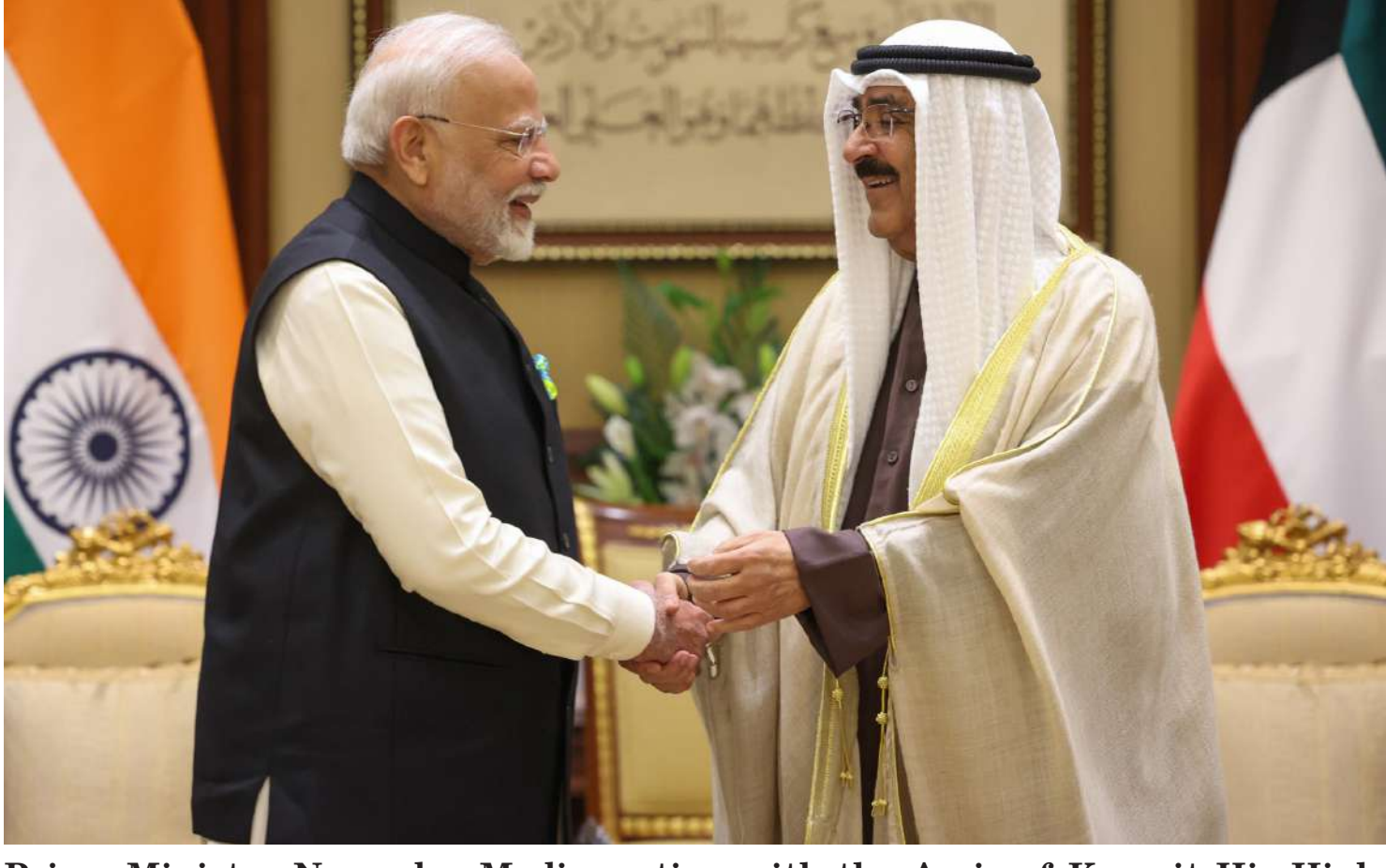
Prime Minister Narendra Modi meeting with the Amir of Kuwait His Highness Sheikh Meshal Al-Ahmad Al-Jaber Al-Sabah in Kuwait.

Modi invited a delegation comprising the Ku-